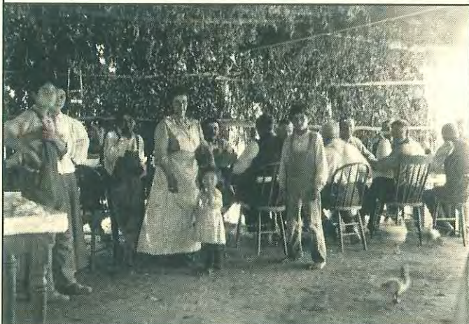
People sitting at a long table under a shady arbor, c. 1910.