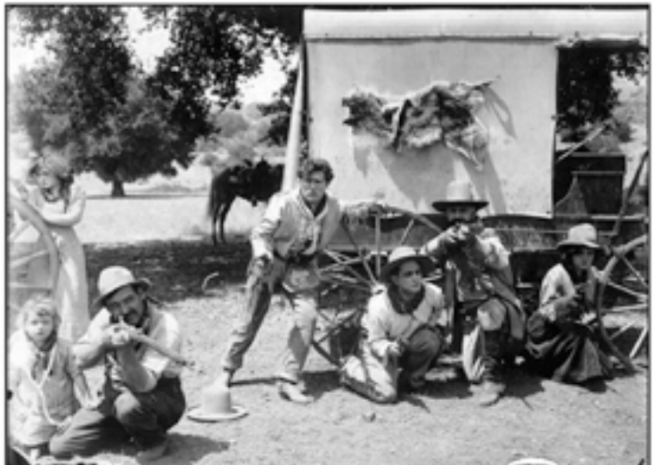
Above: Pathé movie camp in Santiago Canyon, Orange County, California, 1912. OPL008b Below: Filming a western in Santiago Canyon, Orange County, California, 1914. OPL008f