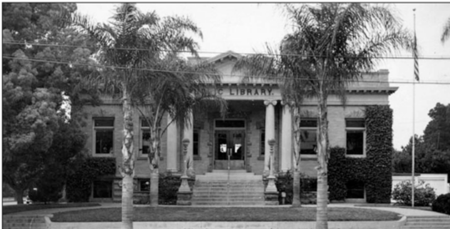
Above: Orange Public Library, 407 East Chapman Avenue, Orange, California, 1940. The Carnegie Library, designed by architect Cornelius B. Bradshaw (d. 1932), opened in 1908 and was demolished in 1961. OPL178