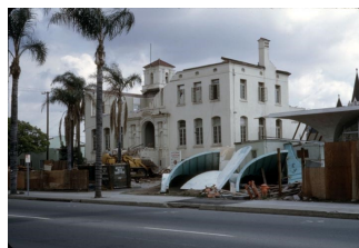
March 1963 - The 1921 City Hall being razed, with concrete forms for the new Civic Center .

Below: Architectural drawing for the new Orange Civic Center