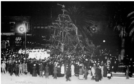
1915 Plaza Christmas Festivities